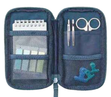
Stationery items storage.

Designed with a belt that can hold pens.